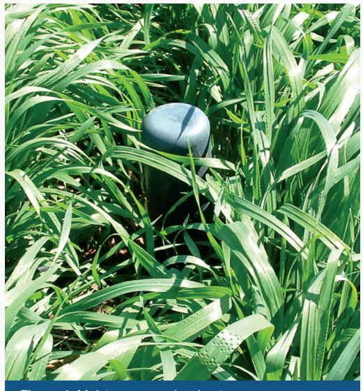
Figure 1: Moisture sensor in wheat crop